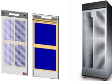
User-replaceable air filters

Allow the UPS easily to be rolled into place